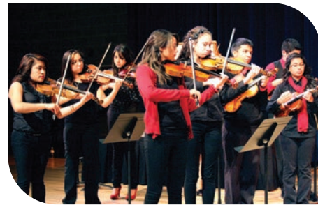
MYSO and Latino Arts Strings launched a partnership in 2006.