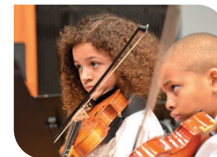
Prelude Orchestra was started in 2012 to create a bridge between MYSO's Progressions and String Orchestra programs.

Begun in 2022, MYSO's newest program, the Prelude Wind Ensemble, provides beginning instruction in woodwind, brass, and percussion instruments to fifth- and sixth-grade Milwaukee children.