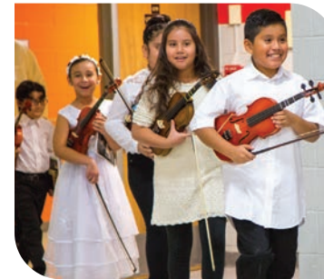
MYSO Scholars, a beginning string program for elementary school children in a predominantly Latinx public school in Waukesha, was founded in 2009.