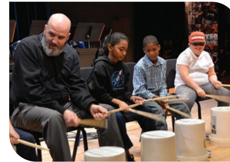
MYSO's Bucket Drumming program, at the Boys and Girls Clubs, began in 2015.