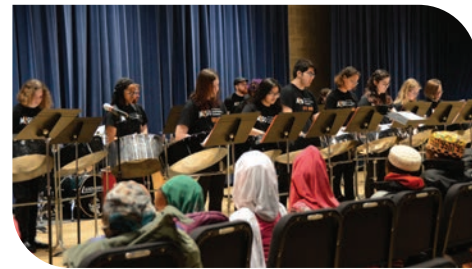
MYSO's Community Concert Series, which began in 2005, offers 25 free concerts each year to 6,000 area school children, engaging them in performances by their peers. These concerts include an educational component, teaching young audiences about the instruments and music they're hearing.