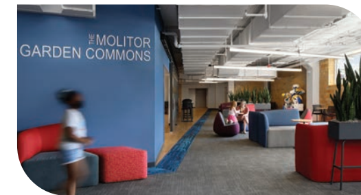
The Milwaukee Youth Arts Center was renovated in 2021, allowing thousands more young people to experience the arts.