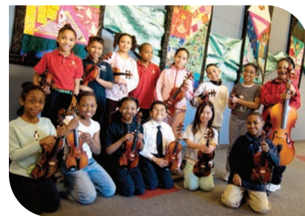
MYSO moved into the Milwaukee Youth Arts Center in January 2005.

MYSO offered a fourth regional String Orchestra rehearsal option, String Orchestra Central, at the Milwaukee Youth Arts Center, beginning in 2005.