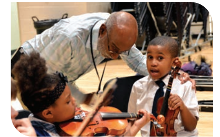
MYSO expanded its Progressions program in 2022.