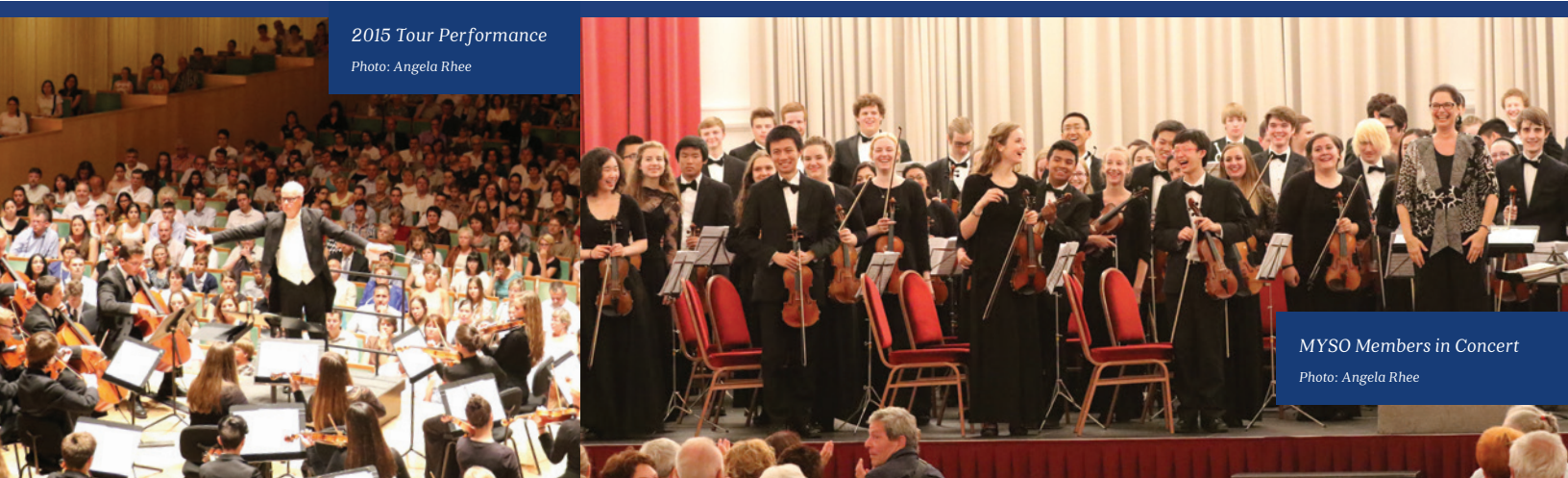
2015 Tour Performance

The tour, which included educational and cultural sight-seeing, allowed students to develop the highest level of artistic excellence in MYSO programs. These students not only see development in musical skill, but also wide-ranging personal skills such as teamwork, discipline, focus, time-management, and confidence.