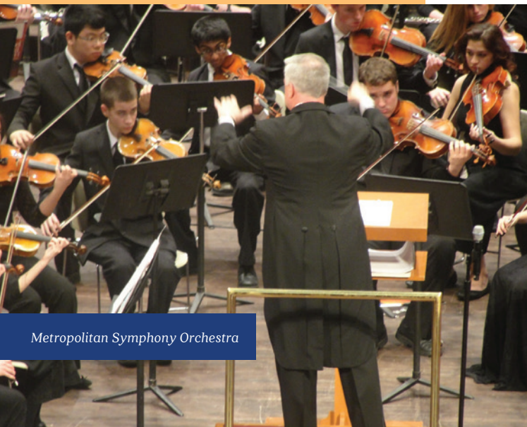
Metropolitan Symphony Orchestra

– Parent of a first year Progressions student