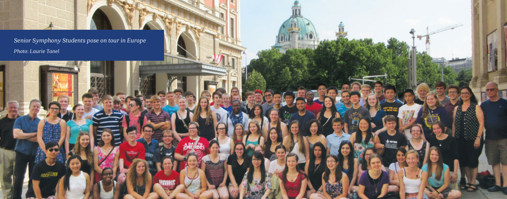
Senior Symphony Students pose on tour in Europe