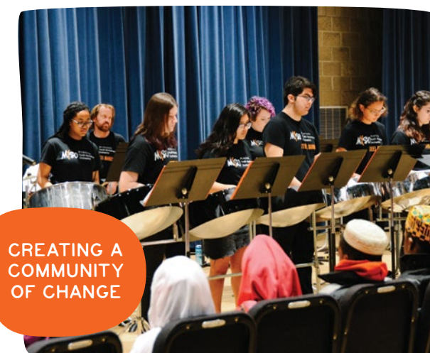
CREATING A COMMUNITY OF CHANGE