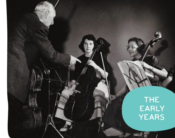
THE EARLY YEARS