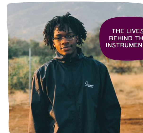
THE LIVES BEHIND THE INSTRUMENTS